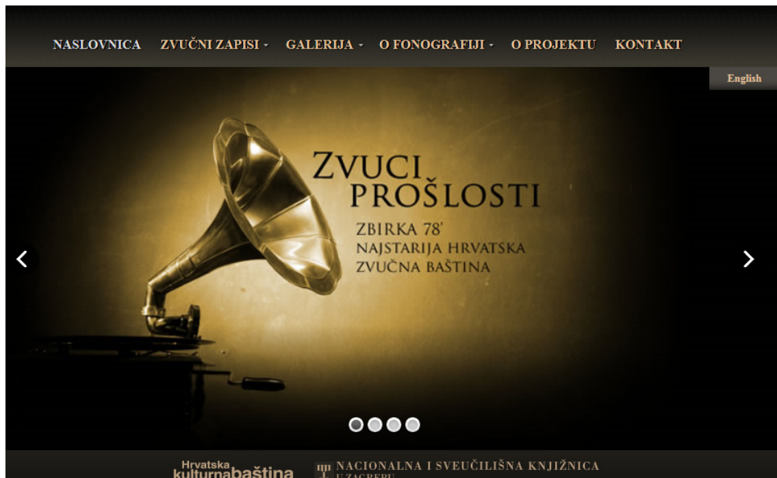
Figure 5. Sounds of the past digital collection homepage