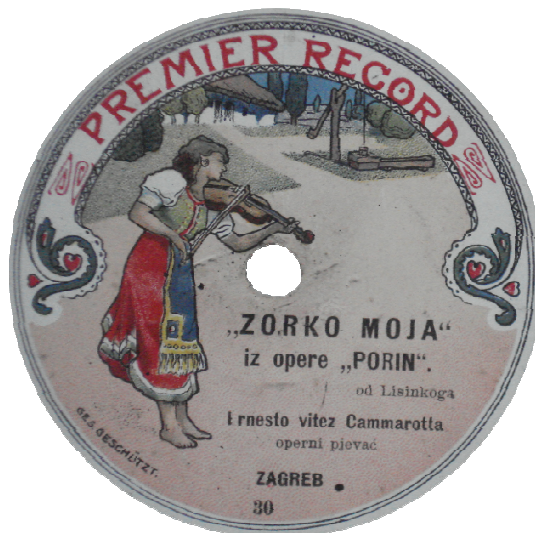
Figure 1. Gramophone record released by Premier Record, 1909. An excerpt from the opera Porin by Vatroslav Lisinski

The project consisted of several project phases. Preliminary activities included gathering the necessary data with the reports about what had been done. In addition, material selection, copyright research (for further publishing on the web) and selection of associates were carried out. It was agreed that the process of digitizing the sound would be done by professional sound engineers of the outsourcing company because The Library didn't own the necessary equipment.