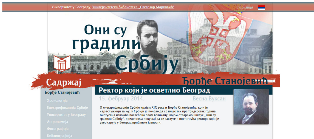
Figure 2: Virtual Exhibition "Đorđe Stanojević – A Rector who lit up Belgrade" homepage in Serbian

The entire exhibition was prepared by a team of 21 experts of different background which was formed through collaboration between University library Belgrade, Belgrade City Library and Faculty of Philology of the University of Belgrade.