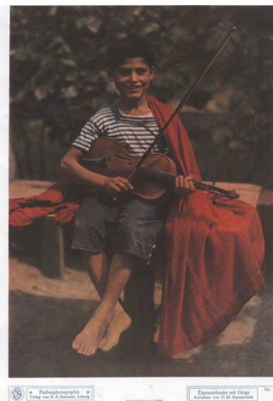
Figure 5: First color photograph in Serbia made by Đorđe Stanojević: A Boy with the Violin