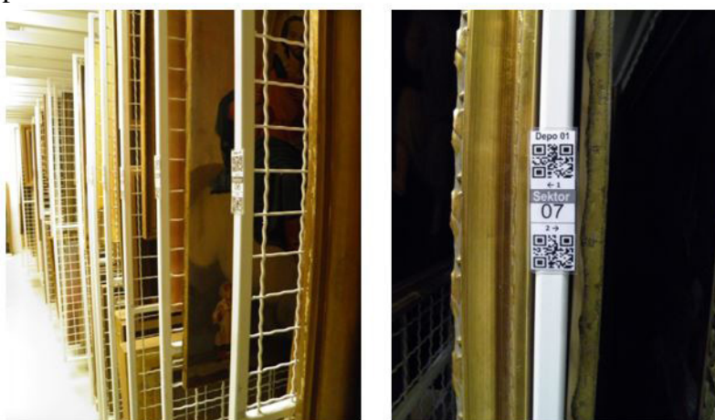
Figure 2: Labeling the storage sectors in depots

To overcome this situation and to facilitate the transition to the new system of marking, the sectors were marked with numbers and "code lists" were made to help in the orientation in space.