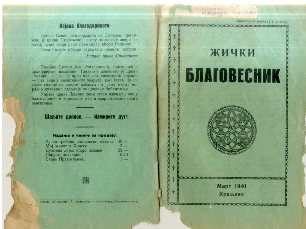
Figure 3: The example of damaged pages

version of the magazine was in this way prepared for further analytical processing and the paper original volumes were returned to the Library of the Serbian Patriarchy and can be viewed on spot, with a permit.