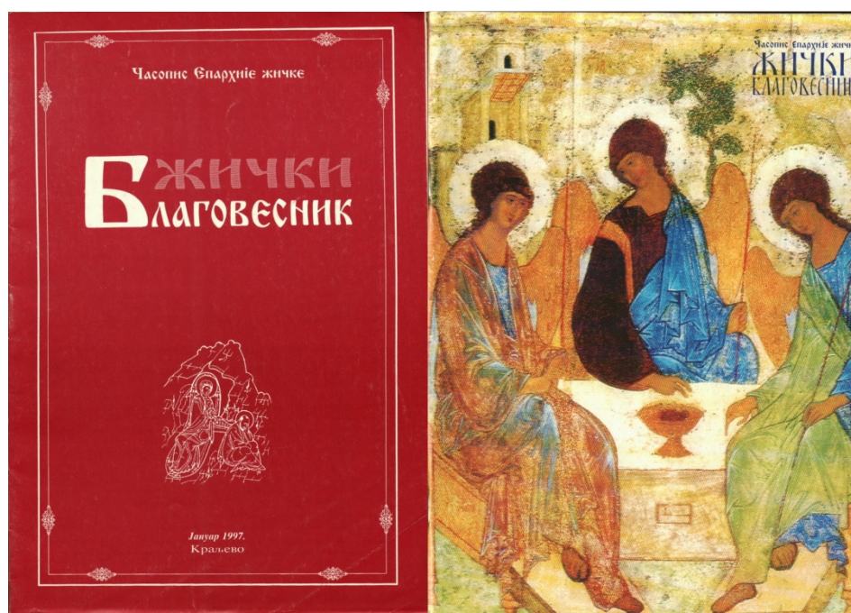
Figure 5: "Žički blagovesnik", the first issue January 1997 and October/December 2008.

The Kraljevo City Library “Stefan Prvovenčani” continues to collect and digitize the issues of this magazine as they come out.