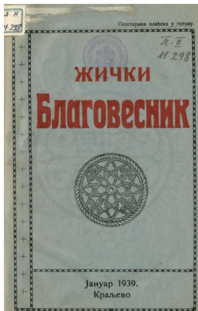
Figure 1: Cover page of the first issue of "Žički blagovesnik" (January 1939)