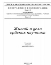
Figure 2. Page of Digital legacy of Mihailo Petrović Alas with his biography

Redovni član Srpske kraljevske akademije postao je 1900. godine i veoma je aktivno učestvovao u njenom radu. Bio je član i više inostranih akademija nauka i velikog broja naučnih društava.