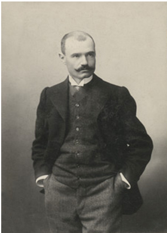
Figure 1 Mihailo Petrović Alas (1868-1943)