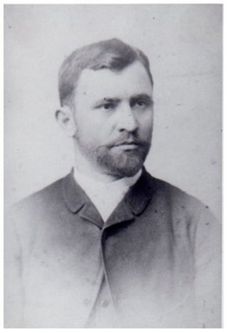
Figure 1. Kojic, 1885.

have enough information from the past which are necessary for all problem-solving aspects of contemporary education. To create ongoing projects in the field of education it is necessary to start from the very beginning, from the constitution of the modern civil system of education.